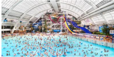
Day pass to World Waterpark

A Choice Pass allows the bearer to enjoy ONE of the following (passes expire in 1 year)