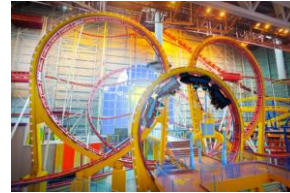
Day pass to Galaxyland Amusement Park

OR any TWO of the following on the same day: