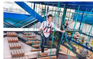
One admission to Rope Quest