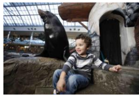
Marine Life incl. Sea Life Caverns/Sea Lion Rock