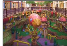
One Round (18 holes) of Prof. Wem's Adventure Golf