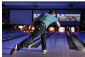
Two games of bowling or one hour of billiards (shoe rental not included) at Ed's Rec Room