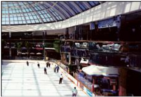
Ice Palace (Skate rental is not included)

OR any TWO of the following on the same day: